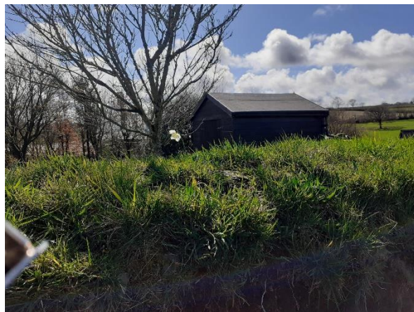
Existing Shed on Site