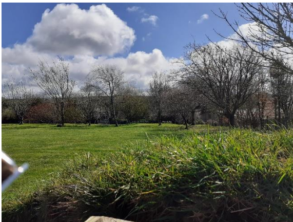
Site from the Highway

The site is located part of the cluster of development at Patchole made up of a selection of dwellings centred around the road junction. The site is accessed from an unclassified road, with the land at a higher level from the road and enclosed by established hedgerows. The site appears to have been used for recreational purposes with a summer house and formal planting having taken place on site.